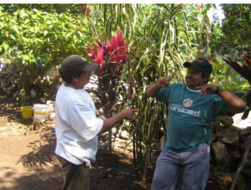
Two men communicating in sign language

In cases where sign language use is widespread, it appears to form part of a wider system of communication, acting to enhance rather than detract from social integration. For example, hearing people in Chican sometimes use sign language to communicate even when no deaf person is present.