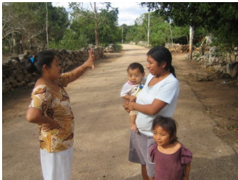
A deaf woman signing to a hearing woman, in a casual encounter on the street.

Findings of an eighteen-month ethnographic fieldwork study are couched in broader discussions of context, colonialism, indigenous studies, identity, deafness, sign language, communication, sensory experience (perception/expression), embodiment, and social constructions of difference and disability. By investigating daily life activities in Chican, paying special attention to the interplay of signed and spoken language, I explore local attitudes towards deafness and discuss the implications that a multi-modal model of language holds for individual wellbeing and group cohesion. In Chican, social life is inclusive and the terms “Maya” or “deaf” do not operate as labels of identity classification.