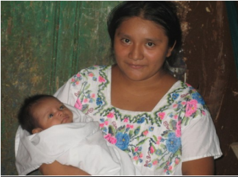
A deaf mother and her baby

The situation for deaf people in Chican presents exceptional circumstances for investigating the relationship between communication and social integration. The ratio of deaf to hearing people in this community is approximately 30 in 1000 whereas elsewhere in the world deafness typically occurs at a rate of 1 in 1000. 1 Intriguingly residents of Chican have developed an elaborate sign language – independent of Mexican Sign Language – that is used by both deaf and hearing people. In this context, where sign language use is widespread among the hearing population, deaf people are not ostracized from the larger hearing society. Rather, they participate freely in social life. This situation contrasts with the experience of deaf signers elsewhere in the world who consider themselves members of a distinct cultural group called Deaf culture. 2